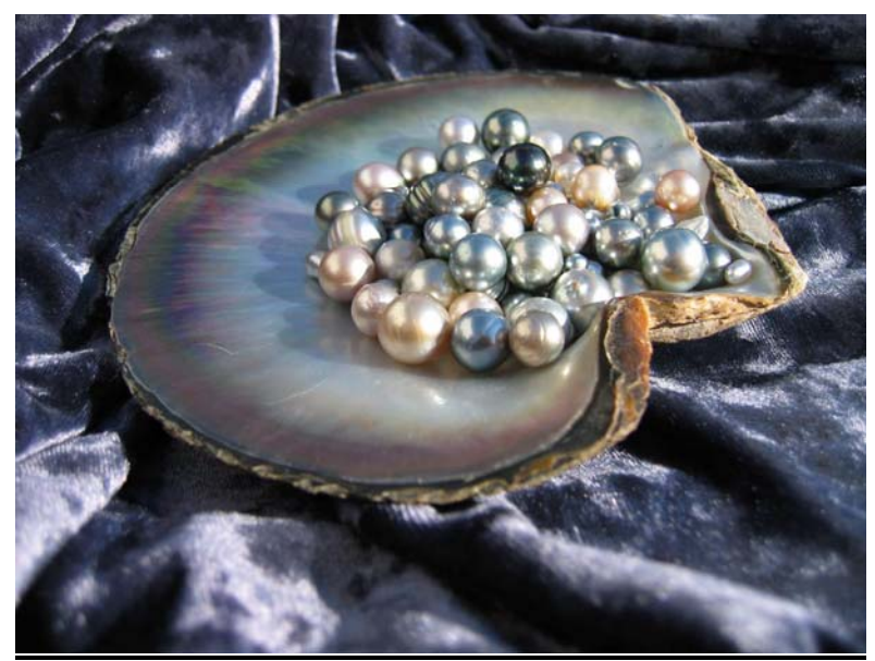
Figure 1: Pearls from the first ever harvest of Hawaiian Black Pearls<sup>TM</sup>, taken from oysters at our pilot-scale grow-out sites on Oahu and the Big Island, February, 2002