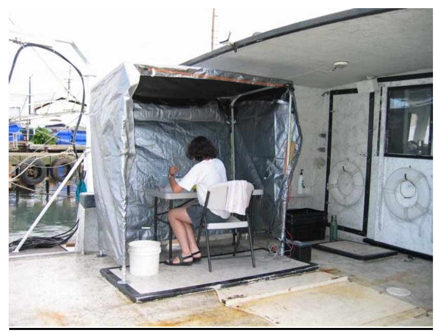
Figure 5 : Berni conducted the seeding in a temporary seeding shed set up on the deck of the R.V. Wailoa. Oahu, Hawaii, February, 2004.