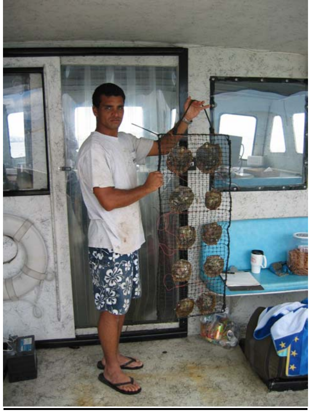
Figure 6 : Once seeded, the large Hawaiian pearl oysters were placed in panels, and returned to the water. Oahu, Hawaii, February, 2004.